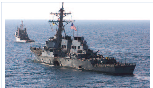
USS Cole (DDG 67) visited Port Everglades August 18, 2011